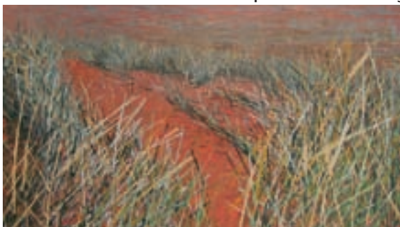
■ Spinifex Vista Liz Cuming